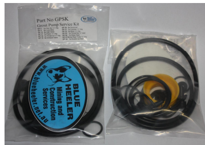
GP40SK Grout Pump Seal