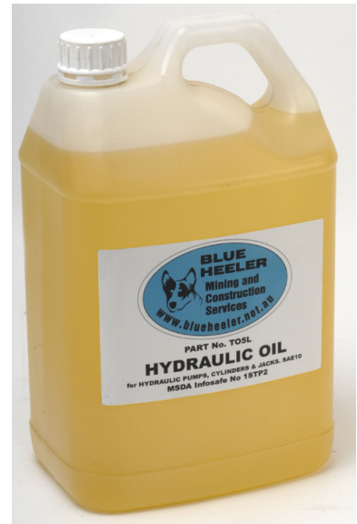
TO5L Tensioner Oil