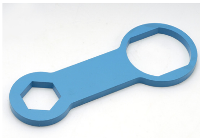
TJDA6S Tensioner jack nose cone and jaw spanner