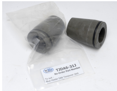
TJDA6-J31 Tensioner Jack Jaws