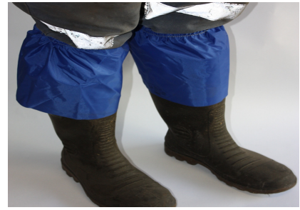
BYBCMED Medium Boot Covers (Blue-Medium. Red-Large)