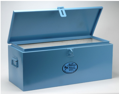
TB-3375 Tool Box