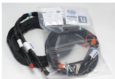
HHDA65M Tensioner Hoses