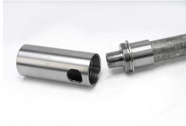
GLHMW9 MW9 Mega Strand Grout Lance