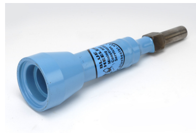
RBDMW9 Roof bolting dolly for MW9 Mega strand