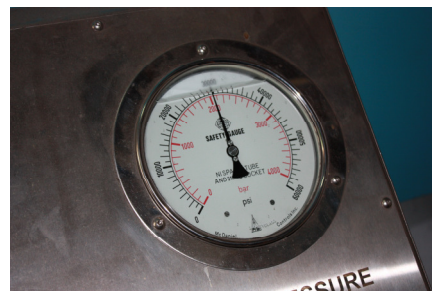
Gauge showing 30000psi

A one metre length of HP-4 (MP 10,000 psi) hose with 101HP-6-4 fittings, the same as used with all Blue Heeler tensioning equipment was tested to 33000psi and held for one minute. We were aiming for 40000psi and the staple clips on the adaptor in the testing chamber started to bend.